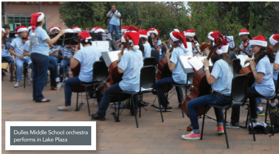
Dulles Middle School orchestra performs in Lake Plaza

The third year of Student Performances in the Park is in full swing with Friday and Saturday performances by talented students from the Houston metro area. Recent schools have included Patrick Henry Middle School band and mariachi, Dulles Middle School Orchestra,