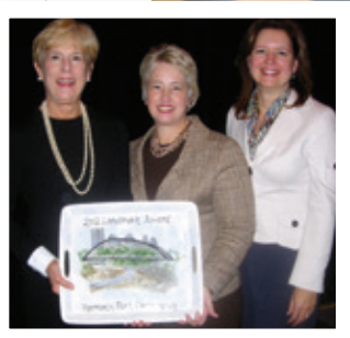
The Bill Coats' Bridge received the 2012 Mayor's Proud Partners' Landmark Award.