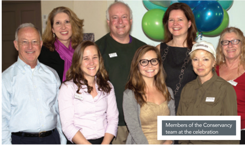
Members of the Conservancy team at the celebration