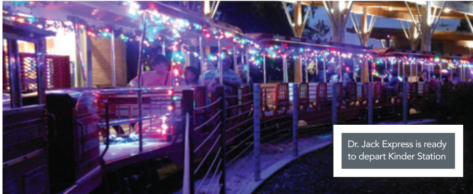
Dr. Jack Express is ready to depart Kinder Station

For the first time, the Hermann Park trains were decorated in the holiday spirit this December. With the Zoo Lights event bringing increased foot traffic through Lake Plaza, the Hermann Park Railroad brought cheer to many visitors with the train's festive garlands and lights, as well as the display of holiday decorations in the train tunnel.