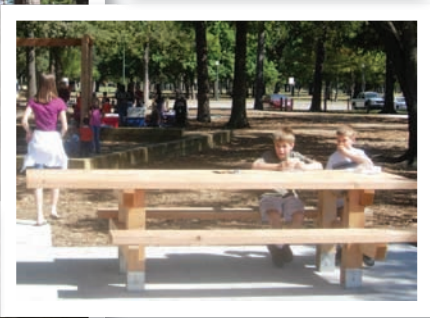
Park visitors enjoy the new swing set and picnic tables in the shady Lake Picnic Area.

Good news! Phase II of the new Lake Picnic Area has been completed. The project was funded by the City of Houston, designed by White Oak Studio, and built by contractor Gulf Coast Landscape Services, Inc. The eight-acre site, which runs from the Molly Ann Smith Plaza to parking lot "E" behind Miller Outdoor Theatre, has been the scene of ongoing improvements, starting with drainage, concrete paths, and lighting completed in Phase I last year.