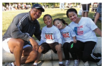
PARK TO PARK RUN see page 3