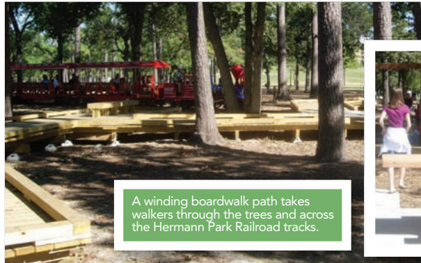
A winding boardwalk path takes walkers through the trees and across the Hermann Park Railroad tracks.