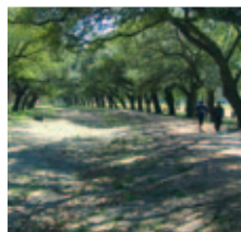
The improved pedestrian trail along North MacGregor will be constructed on the site of the old North MacGregor roadbed, which was once a carriage trail.

Hermann Park Conservancy is a citizens' organization dedicated to the stewardship and improvement of Hermann Park—today and for generations to come.