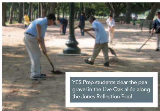
YES Prep students clear the pea gravel in the Live Oak allée along the Jones Reflection Pool.

Volunteers not only help keep the Park beautiful, they aid conservation efforts within the Park. Since the beginning of the Conservancy's 2011 fiscal year last July, nearly 2,600 people have contributed nearly 13,500 hours of service by weeding, raking, planting trees, removing