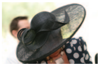
HATS IN THE PARK see pages 4–5

More connectivity improvements on the way include the Bill Coats Bike Bridge, which will link bicycle and walking trails on both sides of Brays Bayou, and a pedestrian underpass, which will take walkers safely under North and South MacGregor and onto the golf course side of the Park.